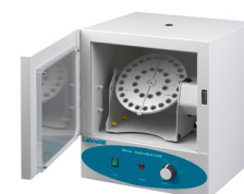
Mini Lab Roller with Mini Incubator